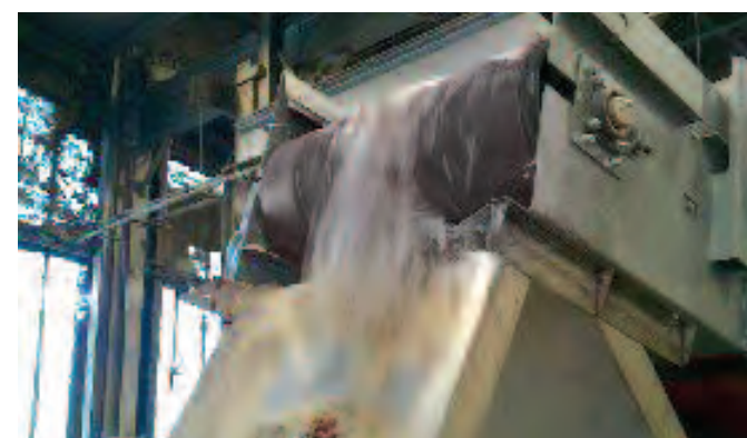
Head Pulley working in an industrial application