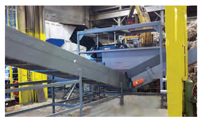
Slider Bed Transfer Conveyor working at a plastics recycler