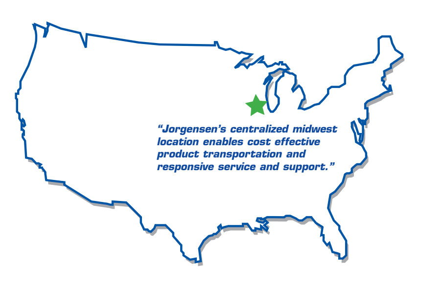
Bulletin 07-02, Rev.0819

www.jorgensenconveyors.com info@jorgensenconveyors.com